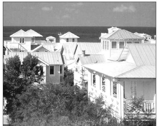
Roofed towers, Figure 34-1-b