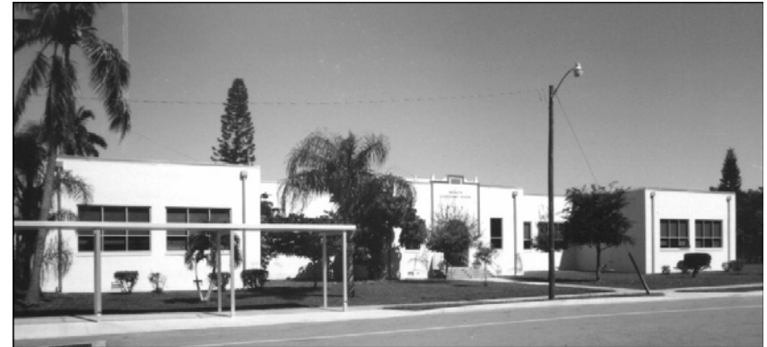
Figure 1 , Fort Myers Beach Elementary School

The school is on an 11-acre site, 7.8 acres of which are buildable uplands. Excellent community facilities are adjacent, including the public library, Bay Oaks park, Matanzas Pass Preserve, and a public swimming pool. (This clustering of public facilities is consistent with the state law’s encouragement of the “co-location” of schools with parks, libraries, and community centers.)