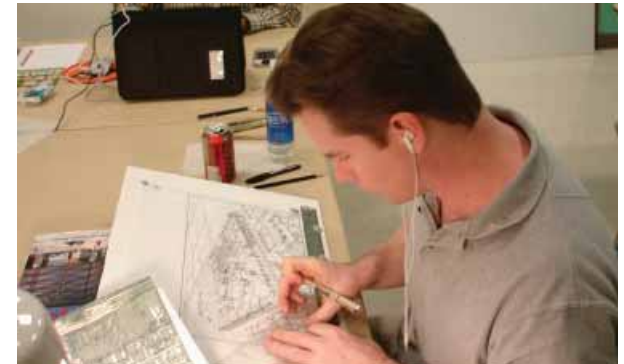
The design team created illustrations of how the corridors could grow more complete.