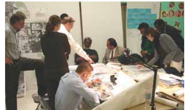
Citizens were encouraged to stop by the studio daily to check the status of the plan.