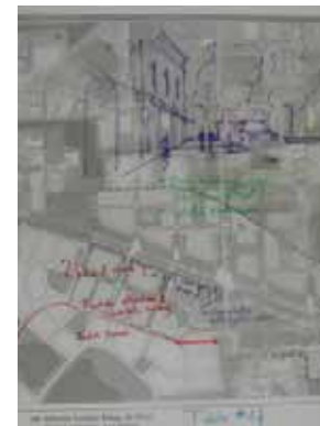
Sample table drawing