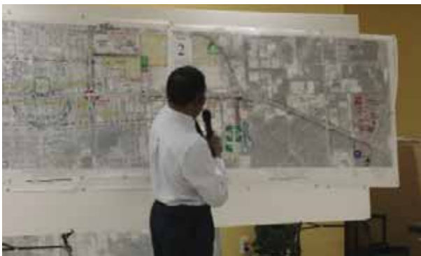
One representative from each table presented their work to the group.