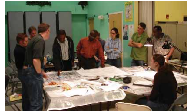
The multi-disciplinary team worked together on the technical components of the plan.