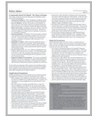
Sample pages from the Charrette Bulletin