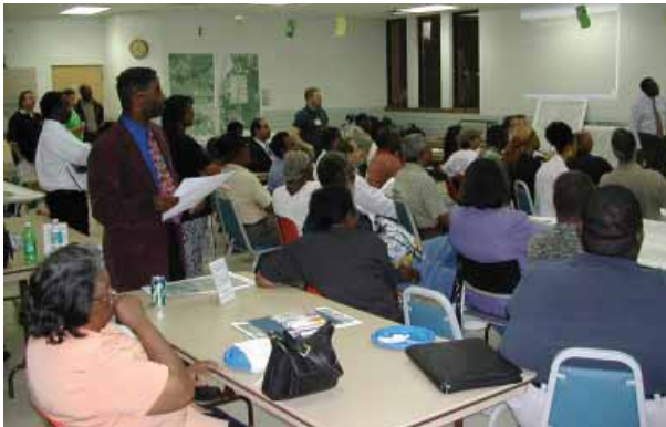
Approximately 60 residents attended the workshop.

Over a period of ten weeks the plan drawings produced during the charrette and the February public hands-on session were refined and the revitalization plan was created. The plan was then submitted for city and community review. The following report represents the community's desires and goals for the future of Dr. Martin Luther King, Jr. Boulevard and Veronica S. Shoemaker Boulevard and sets forth a workable framework of specific implementation measures.