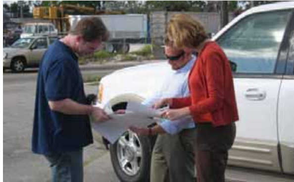
Dover-Kohl team members noted areas of interest in detailed base maps of the study area.

The City of Fort Myers mailed and delivered flyers to property owners to announce the planning events.