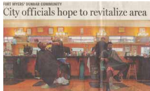
Articles in the News-Press helped to inform the community about the planning process.