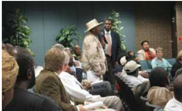
Community members asked questions and offered comments at the end of Work-in-Progress Presentation.