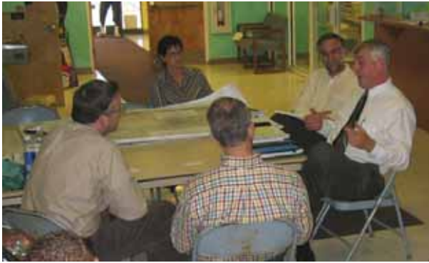
Technical meetings during the week helped to shape the details of the plan.