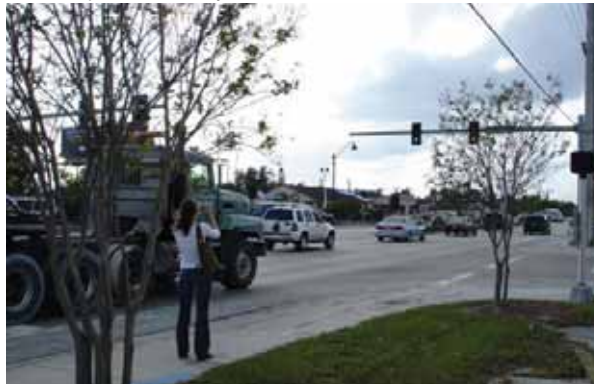
Team members walked and photographed the corridors.