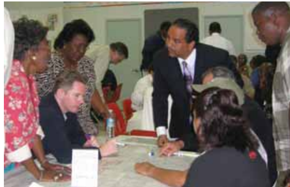
Community members worked together.