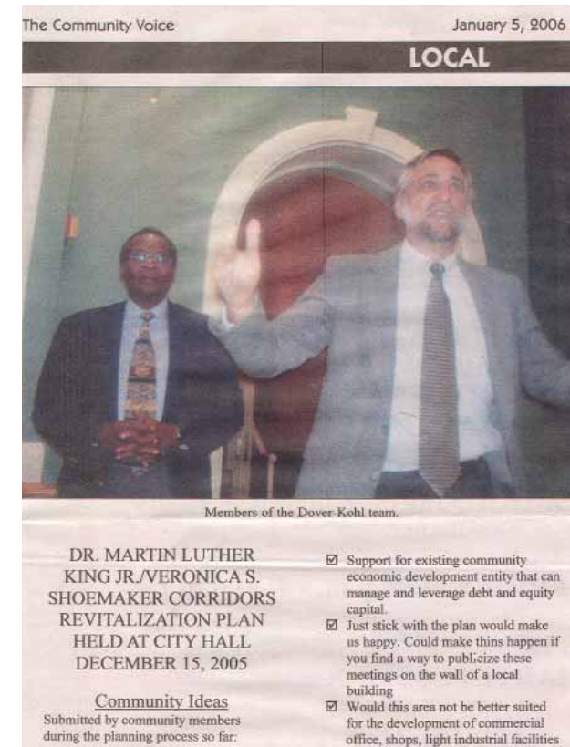
Revitalization events were published in the local paper, Community Voice , to increase public awareness.