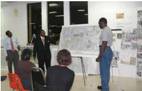
Representatives from the tables presented their ideas.