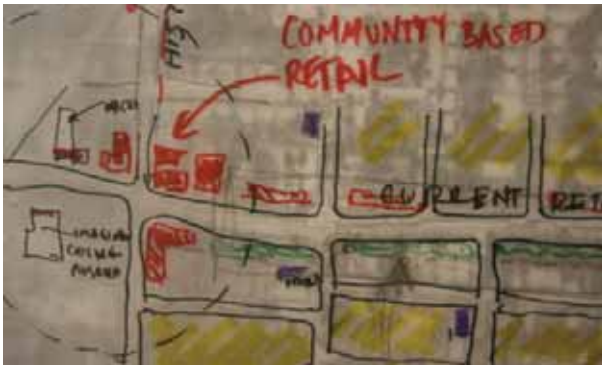
A sample of the drawings produced during the hands-on session