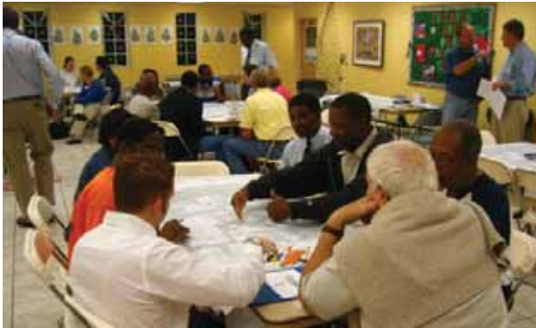
Residents worked together and shared ideas for the future of the corridors and Dunbar neighborhood.