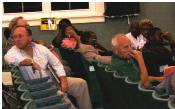
Approximately 80 citizens attended the Kick-off Presentation.