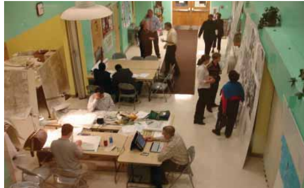
The design studio was located in the Quality Life Center, offering easy access for community members and local leaders to stop-by and add further input to the plan.

From Sunday, December 11 through Thursday, December 15 the design team continued to work with the community in an open design studio at the Quality Life Center on MLK. Citizens and local leaders were encouraged to stop by the studio throughout the week to check the status of the plan, provide further input, and to make sure the design team was on the right track. The table drawings and plans from the Saturday design session were placed around the room for easy review as new people became involved. While community members visited the studio, the design team continued to analyze the information gathered at the hands-on session and site analysis in order to formulate the initial concepts for the plan. The team was tasked with synthesizing the many ideas heard from the community throughout the week into a single cohesive revitalization plan. The planners and designers created lists, diagrams, draw-